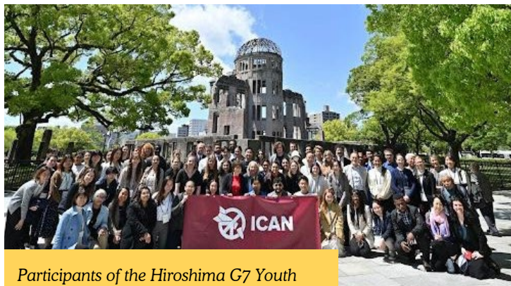
Participants of the Hiroshima G7 Youth Summit