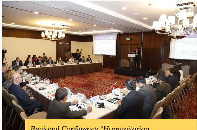
Regional Conference “Humanitarian Consequences of Nuclear Weapons and Nuclear-Weapon-Free Zone in Central Asia”

SGI collaborated with the Ministry of Foreign Affairs of the Republic of Kazakhstan, the International Committee of the Red Cross (ICRC), CISP, and the International Campaign to Abolish Nuclear Weapons (ICAN) to host a regional conference in Astana, Kazakhstan. The conference, titled “ Humanitarian Consequences of Nuclear Weapons and Nuclear-Weapon-Free Zone in Central Asia ,” provided a platform for in-depth discussions on the humanitarian impacts associated with the development, testing, and use of nuclear weapons, as well as related international and regional legal frameworks, victim assistance, and environmental remediation. Representatives from the five Member States of the Central Asian Nuclear-Weapon-Free Zone Treaty (Semipalatinsk Treaty)—Kazakhstan, Kyrgyzstan, Tajikistan, Turkmenistan, and Uzbekistan—were in attendance. An SGI representative delivered a presentation on the role of peace and disarmament education in promoting disarmament and universalizing the norms of the TPNW.