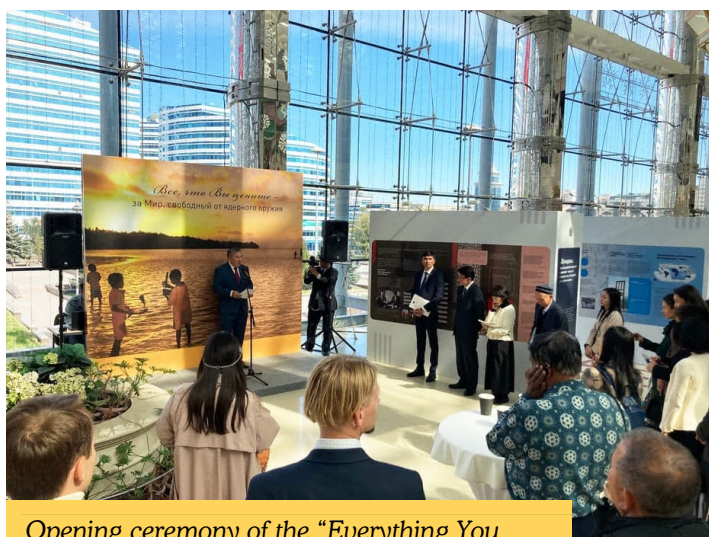
Opening ceremony of the “ Everything You Treasure—For a World Free From Nuclear Weapons ” exhibition

Since its inception in 2012, the antinuclear exhibition “ Everything You Treasure – For a World Free from Nuclear Weapons ,” produced by SGI in collaboration with ICAN, has been displayed in numerous countries and regions. The exhibition is designed to elevate public awareness about nuclear weapons by exploring the issue through twelve diverse lenses, including humanitarian, environmental, economic, human rights, spiritual, and gender perspectives.