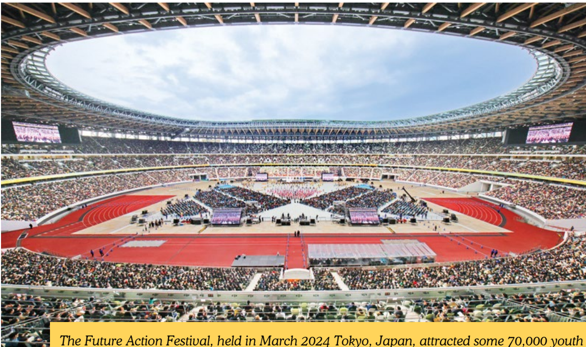
The Future Action Festival, held in March 2024 Tokyo, Japan, attracted some 70,000 youth and was live-streamed to over 500,000 viewers. The festival sought to elevate public consciousness regarding nuclear disarmament and the climate crisis and to foster solidarity among Japanese youth to address these global challenges.

The Future Action Festival took place at the National Stadium in Tokyo, Japan, on 24 March 2024. It was organized by the organizing committee which consisted of six members representing youth-centric organizations including the SGI Youth in Japan. This event was part of the lead-up to the upcoming Summit of the Future, scheduled for September 2024 at the UN headquarters in New York. The festival sought to elevate public consciousness regarding nuclear disarmament and the climate crisis and to foster solidarity among Japanese youth to address these global challenges. The festival attracted some 70,000 youth and was live-streamed to over 500,000 viewers. In preparation, the organizing committee conducted a youth awareness survey from November 2023 to February 2024, targeting individuals aged 10 to 49, with a total of 119,925 participants. The insights gathered were integral to the formulation of a joint statement , which was subsequently presented to the Rector of the United Nations University in Tokyo.