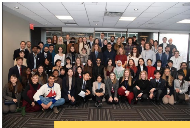
Youth MSP participants in New York

SGI has actively supported the initiatives led by Youth for TPNW, including the Youth Meetings of States Parties (Youth MSP) to the TPNW. As a member of the Youth for TPNW's steering committee, an SGI representative played a key role in planning and coordinating the Youth MSP and its accompanying pre-MSP programs, which coincided with the First and Second Meetings of States Parties to the TPNW. During these Youth MSP sessions, participants had the invaluable opportunity to hear firsthand testimonies from Hibakusha in Hiroshima and Nagasaki and to broaden their perspectives on nuclear abolition. Notably, at the 1st Youth MSP, SGI facilitated a workshop on grassroots educational activities in collaboration with Senzatomica. This youth-led effort not only motivated numerous attendees to participate in the subsequent TPNW MSPs but also contributed to enhancing youth engagement in nuclear abolition efforts at local, national, and international levels.