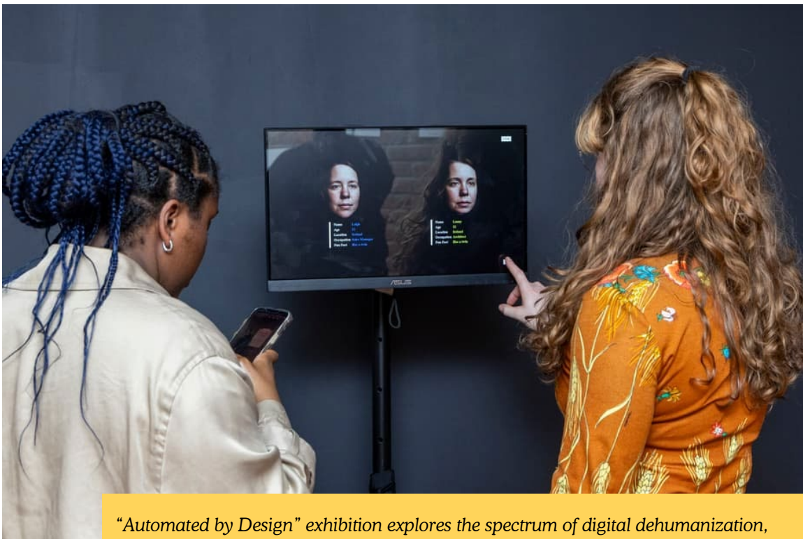
“Automated by Design” exhibition explores the spectrum of digital dehumanization, and situates autonomous weapons systems in the broader context.

In partnership with Stop Killer Robots and Amnesty International, SGI supported the work of Identity 2.0, a creative studio at the nexus of digital rights, technology, and identity. This studio was commissioned to develop "Automated by Design," an impactful and engaging exhibition. This exhibition elucidates the concept of autonomous weapons, places them within the broader context of digital dehumanisation and automated harm, and bolsters SKR's mission to spearhead the development of new international legislation governing weapon system autonomy. Premiering alongside the 2023 UN General Assembly First Committee, the exhibition was launched on 13 October 2023 near UN Headquarters, attended by diplomats, UN officials, and civil society members. Over 60 individuals attended the launch. The exhibition also played a significant role at the international conference, “Humanity at the Crossroads: Autonomous Weapons Systems and the Challenge of Regulation,” held on 29-30 April 2024 at the Hofburg Palace in Vienna. It facilitated deeper insights among attendees from diverse sectors—including states, the United Nations, the ICRC, international and regional organizations, academia, think tanks, industry, and civil society—into the digital harms propelled by AI technology. Additionally, the exhibition microsite offers a digital counterpart to the in-person exhibition experience.