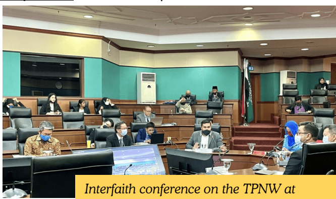
Interfaith conference on the TPNW at International Islamic University Malaysia

Hosted at the International Islamic University Malaysia (IIUM), the interfaith conference entitled “National Implementation and the Role of Youth” convened representatives from various universities and non-governmental organizations to discuss and promote youth advocacy for nuclear disarmament. During a panel focused on the humanitarian impact of nuclear weapons, a representative from Soka Gakkai Malaysia (SGM) presented an overview of both SGI's and SGM's contributions to nuclear disarmament. These efforts include organizing exhibitions, engaging in interfaith dialogues, conducting seminars, producing documentaries, and participating in radio interviews.