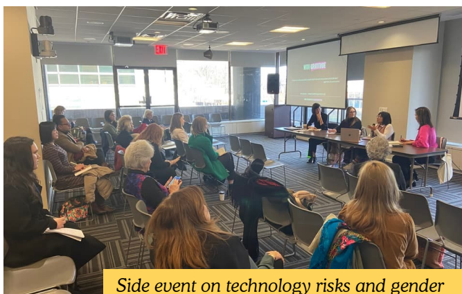
Side event on technology risks and gender equality introduced the concerns about autonomous weapons systems to the CSW community.

During the 67th session of the Commission on the Status of Women (CSW), SGI hosted a parallel event titled “Women’s Leadership for Human-Centered Technology.” co-sponsored by Stop Killer Robots (SKR), the NGO Committee on the Status of Women, New York, and the Footage Foundation. The panel addressed the dual nature of technology, highlighting its potential dangers when