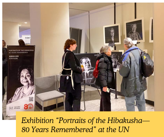
Exhibition “Portraits of the Hibakusha—80 Years Remembered” at the UN